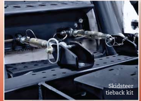
Skidsteer tieback kit

Working efficiently means working smoothly, digging and swinging in rhythm. Swinging the boom is controlled by cushioning hydraulic cylinders that reduce machine shake by slowing the boom as it reaches the furthest ends of the swing range.