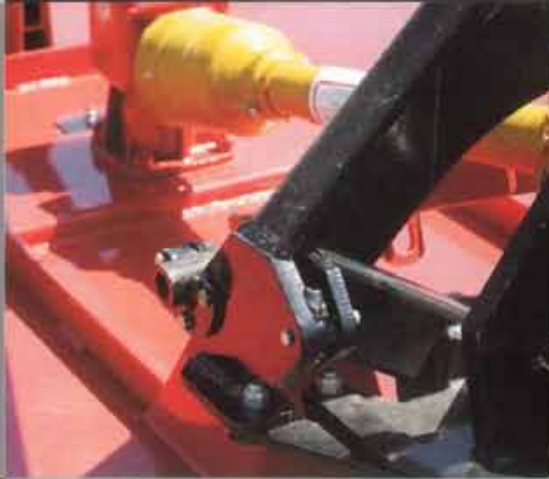
Tool Arm Stand when tractor is unhitched.

Breakaway Linkage to protect equipment from damage if outer corner or cutter contacts an obstruction.