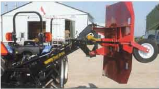
Tool Arm Raised to Transport Folding position