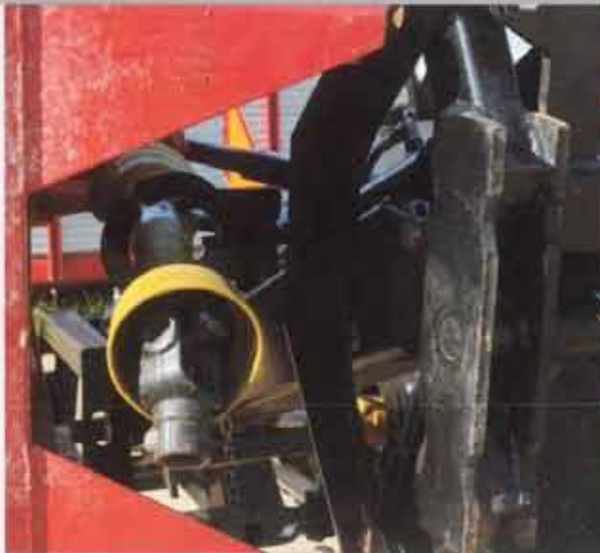
PTO holder used in transport position.