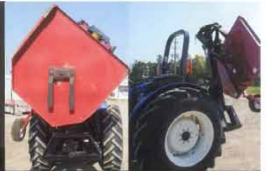
Tool Arm in Transport Position (weight is close to centerline of tractor)

Transport arm in the collapsed position to reduce stress to the arm and also to stabilize the weight.