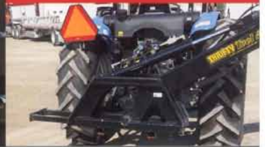
Counterweight Bracket (extended) for suitcase weights add up to 500 lbs of counter weight.