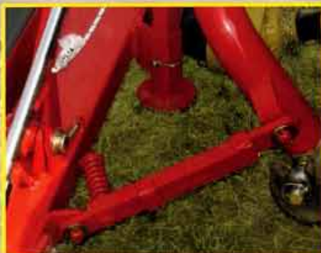
SAFETY BREAK-AWAY MECHANISM