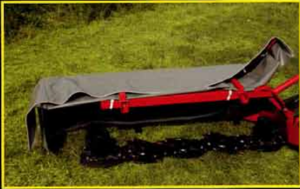
DMP 210 DISC MOWER