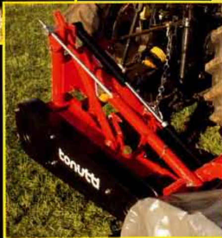
HYDRAULIC LIFT AND SUSPENSION SYSTEM