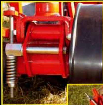
BELT TENSIONING SYSTEM