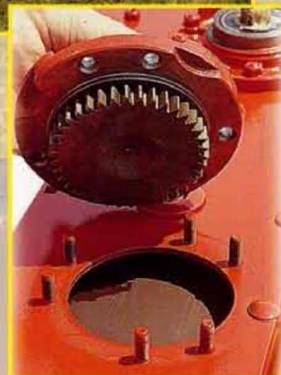
FAST AND EASY REMOVAL AND INSTALLATION OF DISC BEARING STATION