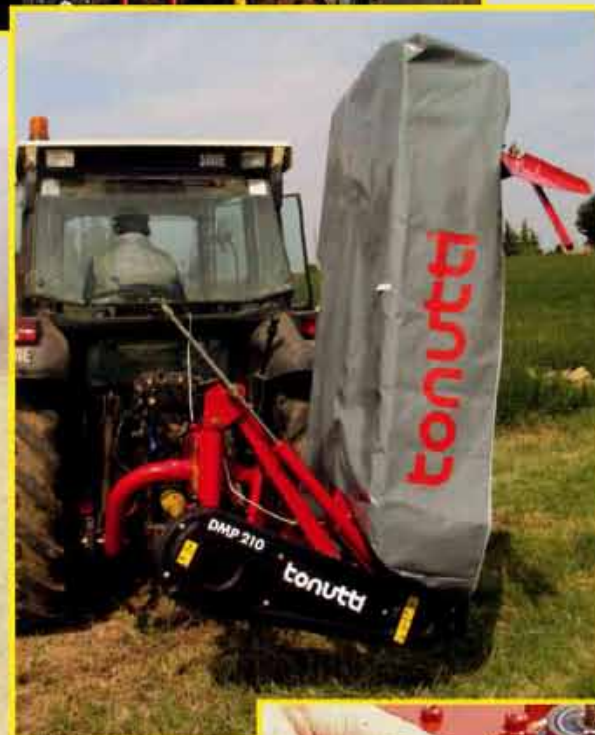
DMP 210 IN TRANSPORT POSITION