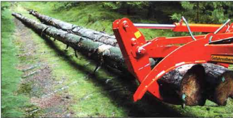
The grapple will easily handle logs up to 20-30 mtr / 60-90 ft. The swing cylinder of the grapple must be connected to a float section of the tractor's hydraulic valve assembly.

Lower link attachment point also has a slot enabling log towing with a forestry chain or cable sling.