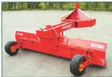
Leveller: 8 models