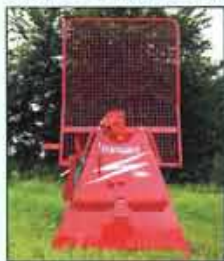
Winches: 2,8 →9 ton