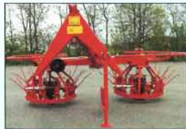
Multi-function-rakes: 9 models