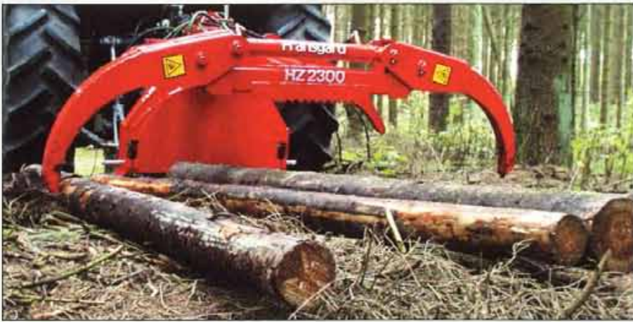
The wide opening of 2,3 mtr / 90 in., makes it easy to grip the logs. The grapple can also swing hydraulically from side to side.