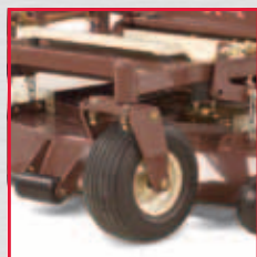
DuraFlex™ suspension forks