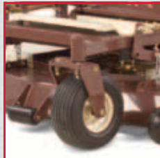
DuraFlex™ suspension forks