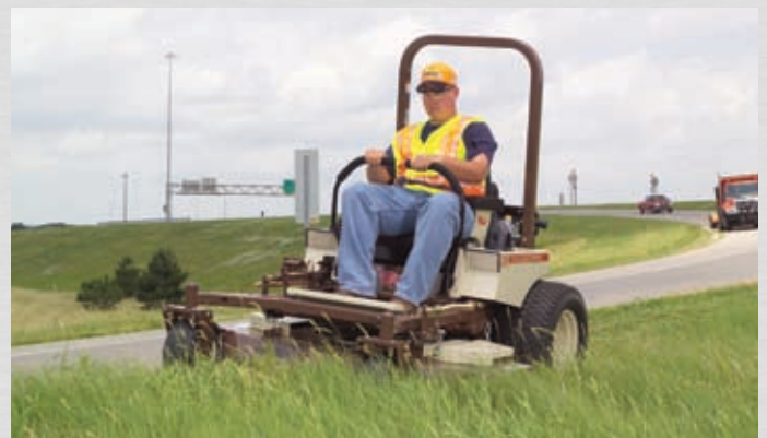
Knock down the tall stuff and throw the clippings out back.