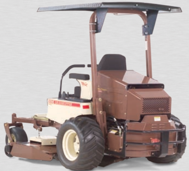
Shown with optional aluminum sunshade canopy.