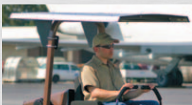
Aluminum (75 lbs): Fits 200, 300, 400, 700 and 900 Series.

Diamond-plated aluminum or heavy-duty vinyl sunshade canopies mount on ROPS to shield operator from the sun while providing plenty of headroom, limiting exposure to direct sunlight and heat, reducing eye strain and increasing operator comfort.